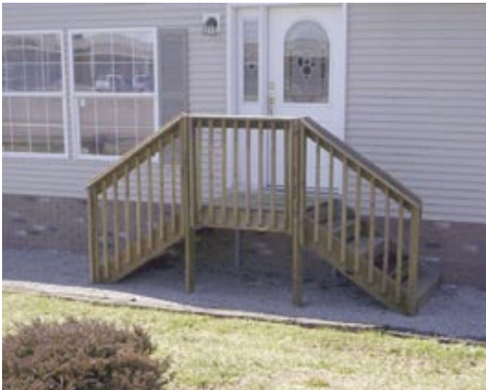
Assembly 205392 is pictured above, containing a top deck or "landing" plus four treads for a total of five "steps."